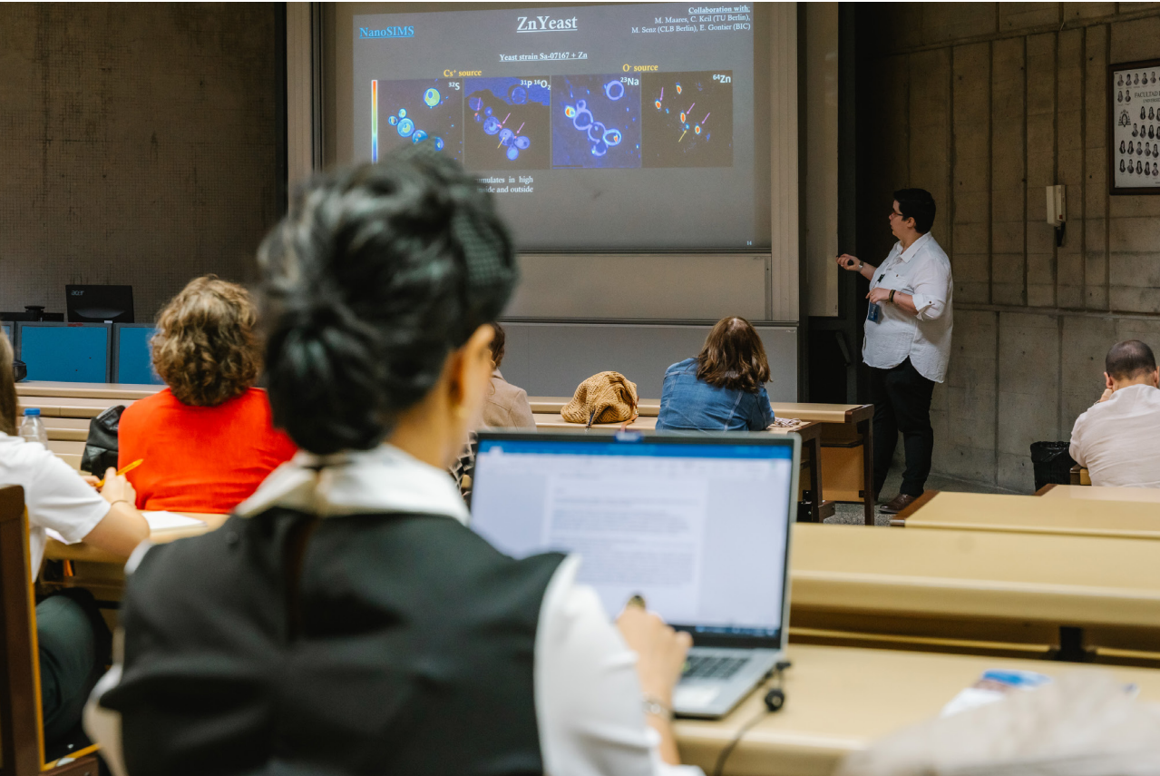
Participants at the XI AUSE Conference and VI ALBA User's Meeting, held in Oviedo from 2nd to 6th September 2024.